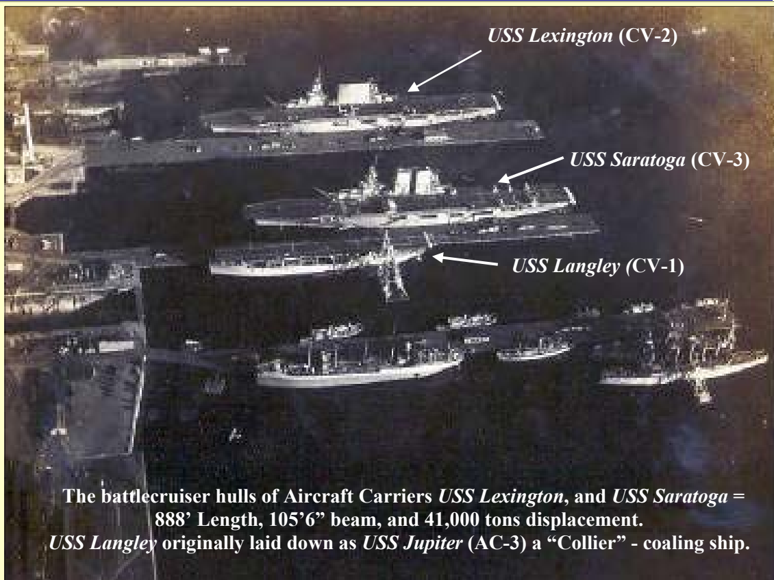
The battlecruiser hulls of Aircraft Carriers USS Lexington , and USS Saratoga = 888’ Length, 105’6” beam, and 41,000 tons displacement. USS Langley originally laid down as USS Jupiter (AC-3) a “Collier” - coaling ship.