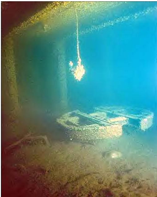
Admiral's Cabin on Arizona's second deck. Showing are a large table, an overturned chair, and the overhead light fixture with the light bulb still intact.