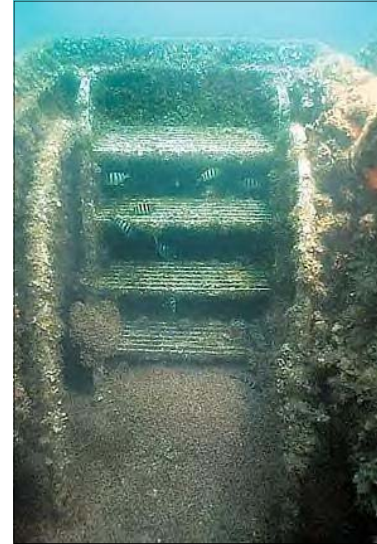
Ladder leading to the Captain's Cabin on USS Arizona