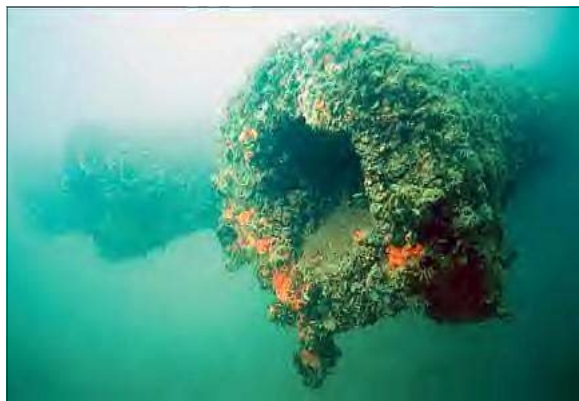
USS Arizona ’s 14-inch guns could fire 1,500 pound shells 20 miles.