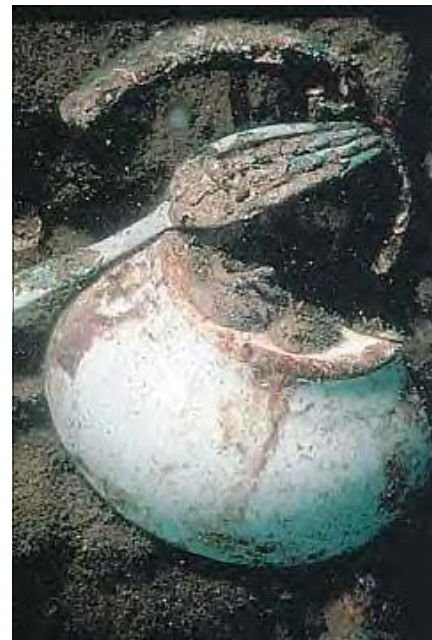
USS Arizona ceramic bowl and fork lie as they fell on December 7, 1941...