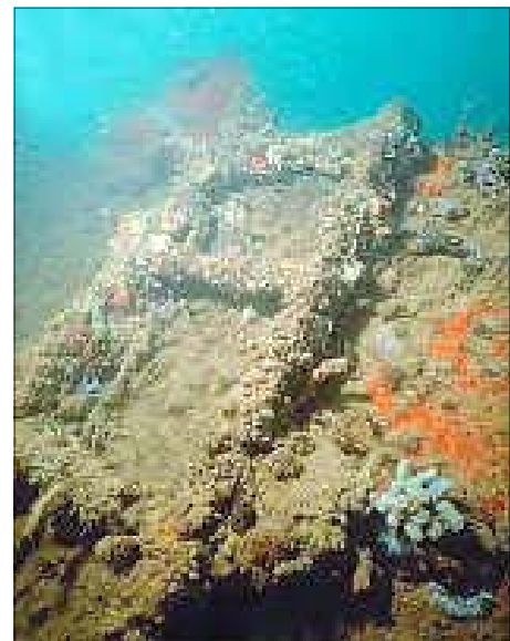
A ladder to number one turret... USS Utah (BB-31)