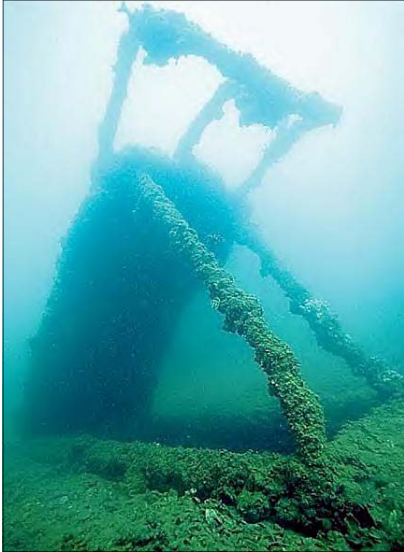
A hatch cover still raised... USS Arizona